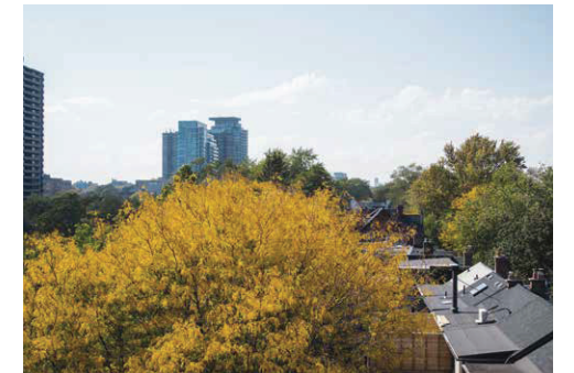
→ 👁 WEST VIEW