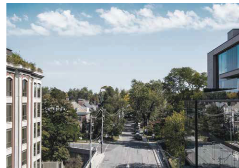
← 👁 EAST VIEW